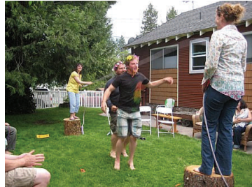
There was "stump tug-of-war" and "sobriety jump roping."