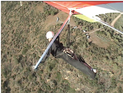
View of launch and parking area from above.