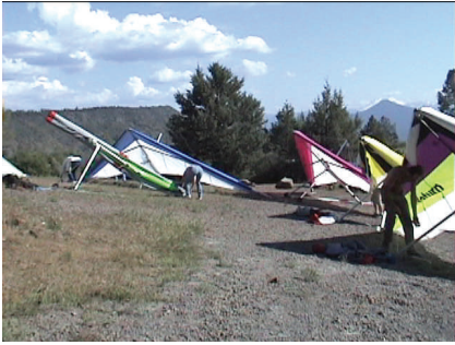
Some of the gliders setting up.

The weather was great all weekend long and pilots flew every day. A group of pilots were up from the Sacramento area and I had a new wing-mounted camera mount to try out.