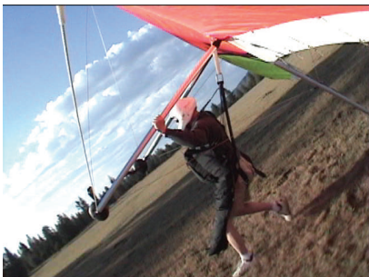
Landing in the #2 LZ—the XC is proving to be a great landing glider : )