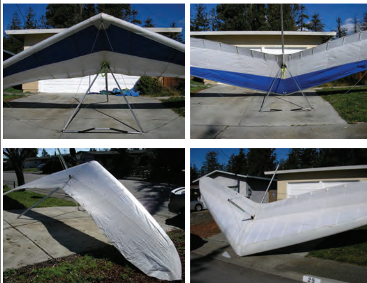
Moyes SX5—Super Extralite 154.

Glider is in great shape. Well padded and well cared for. Bought it from Sacramento Hang Gliding with low hours. Have one spare down tube, manual, and two batten charts. The bag is in decent shape with a new zipper. $500.00