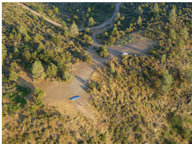
- Setup area before the trees were vandalized -

A request to the Forest Service has been put in for permission to remove the felled trees and put down more ground cover in the setup area. The felled trees could be used to restore the old wind block known as the "hedgerow." This will be pending FS approval. Below are before and after photos of what the desired outcome would be.