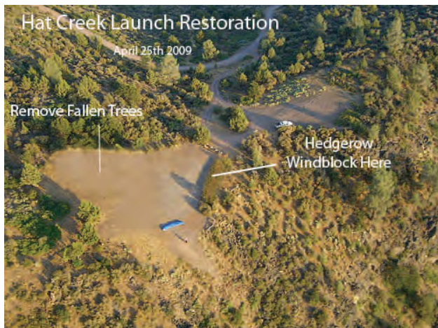
- Setup area after the proposed clean up -